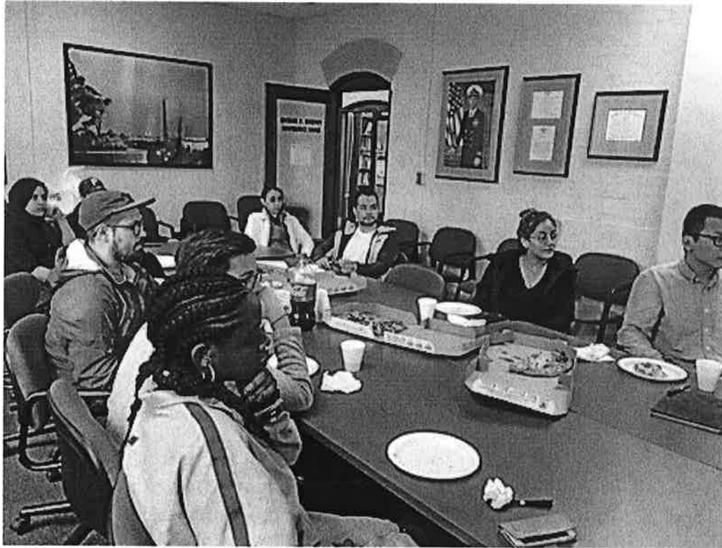
Club members listen to a guest speaker.