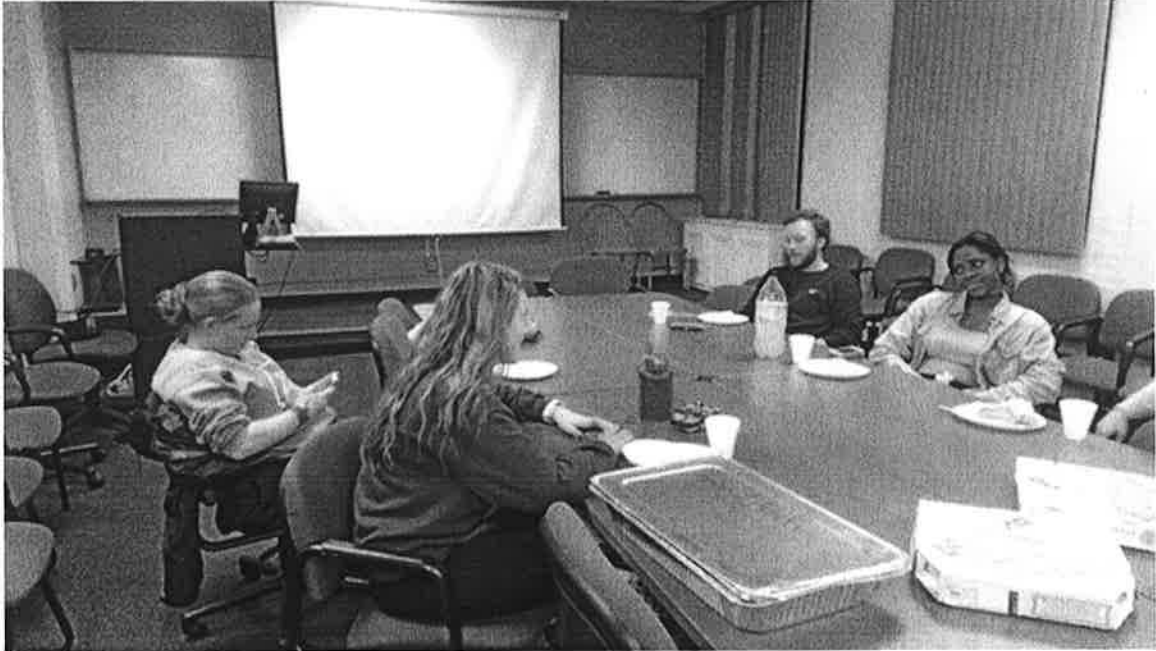
Students enjoy a study break thanks to the National Office photo contest!