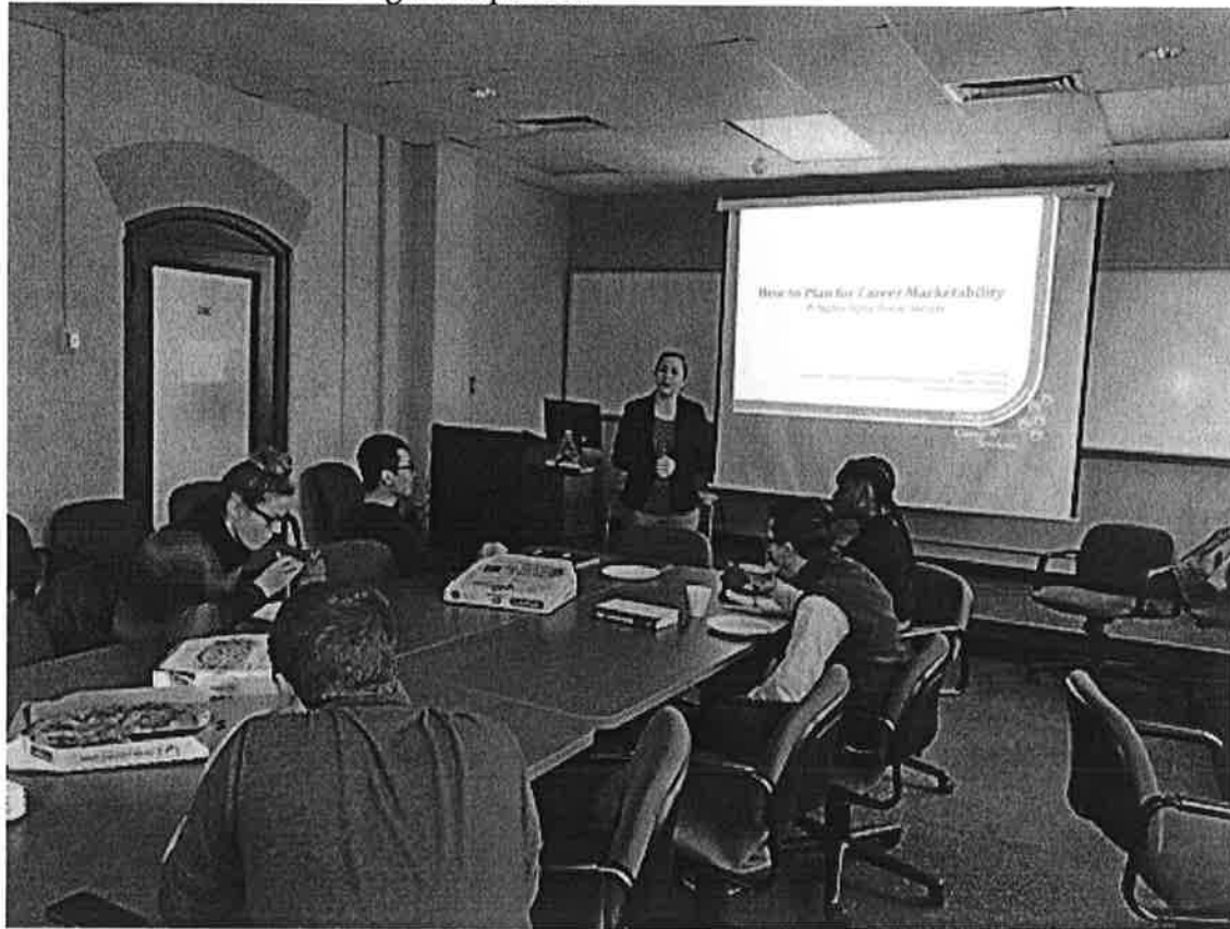
Marketing the Political Science Major workshop.