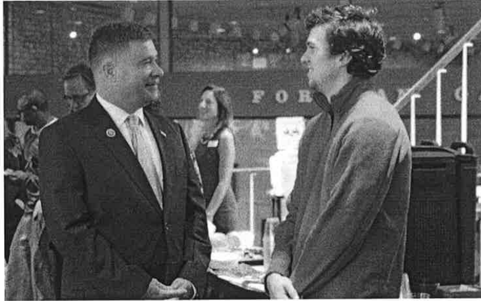
U.S. Representative Chris Gibson, at Hartwick College, on September 14, 2015

College student at the reception following his event, which was held in Andersen Theatre on the Hartwick College Campus.