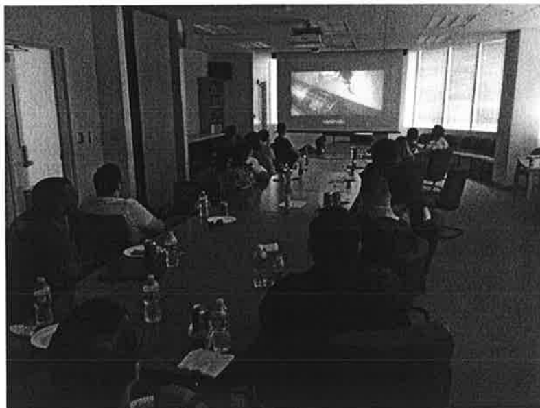
Above: Students and faculty watch Bridge of Spies (03/04/16).

Students and faculty watched Steven Spielberg's Bridge of Spies and had a discussion of Cold War international politics at the conclusion of the film.