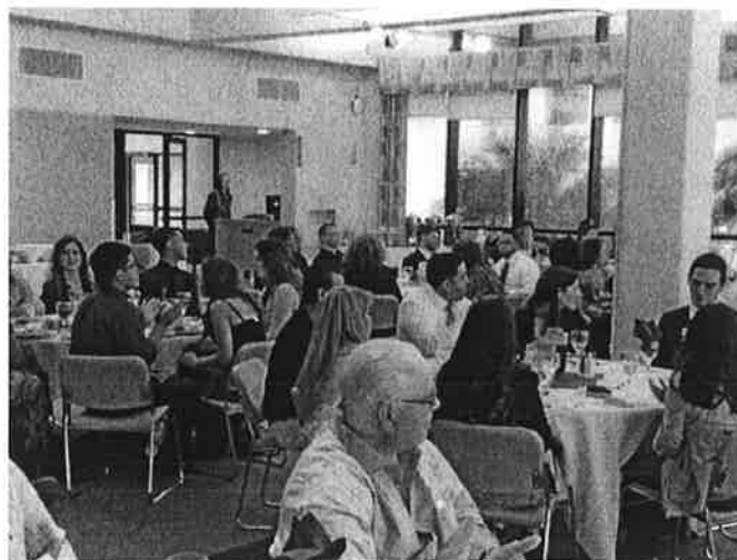
Above: Guests at our 40 th Annual Banquet (05/13/2016).