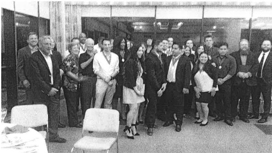
Above: Theta Iota Members and new inductees at 40 th Annual Banquet (05/13/16),