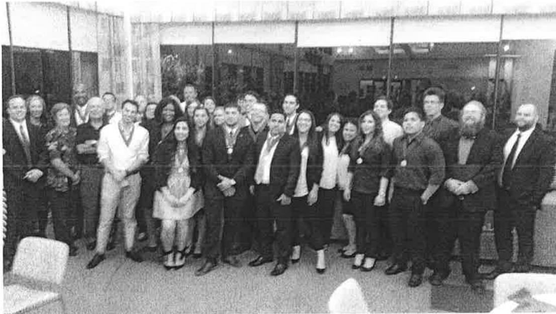
Above: Pi Sigma Alpha, Theta Iota inductees and members in Obershaw Dining Room (05/13/2016).