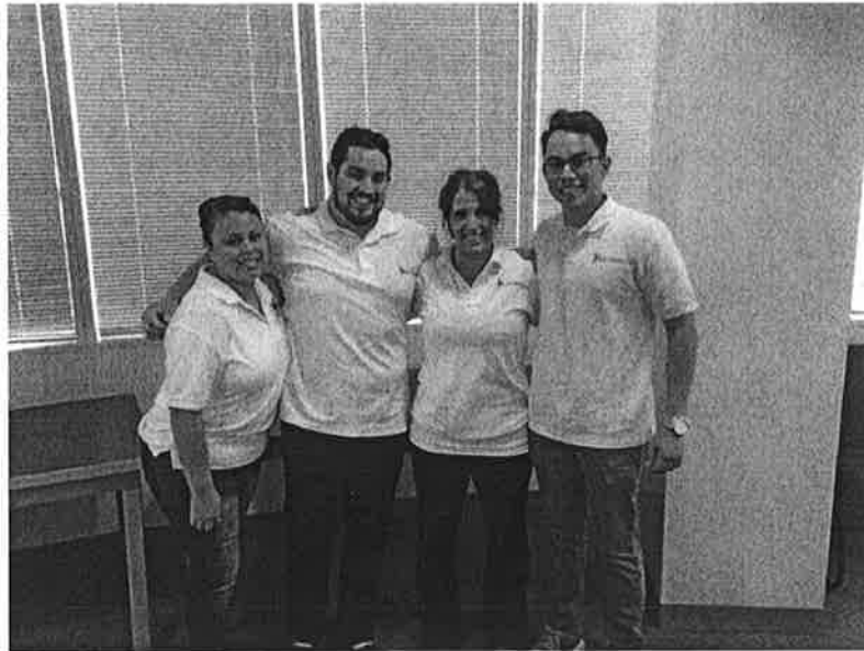
Above: Theta Iota Officers at the conclusion of our final event of the year! (06/08/16)