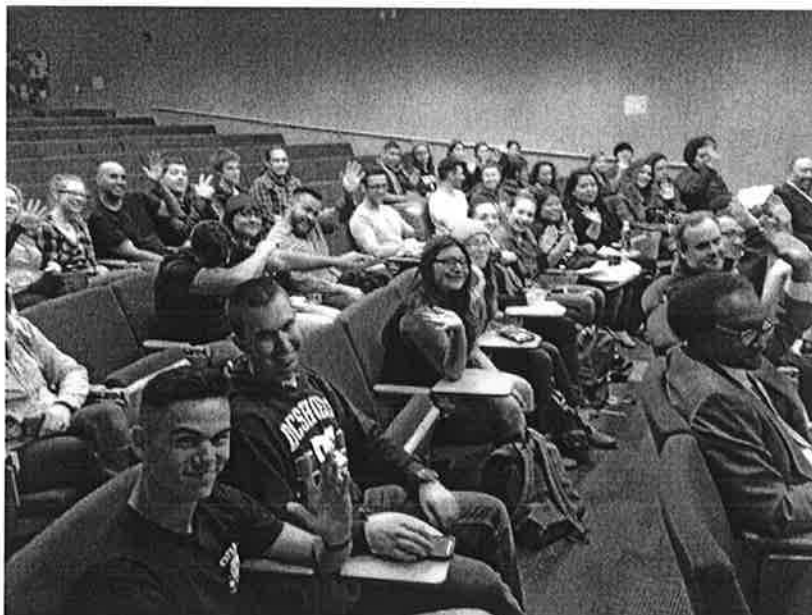
Above: Students and faculty at "The 2016 Election and the Future of American Politics" (03/11/16).